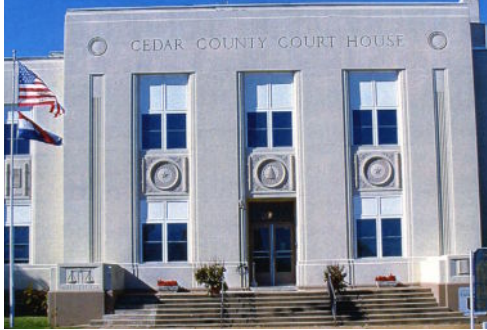
Cedar County Courthouse 113 South St., Stockton, 65785

Creating and retaining new jobs is a priority for Cedar County and its economic development partners, the Cedar County Commissioners, Stockton Area Chamber of Commerce and City of Stockton. The Enhanced Enterprise Zone is a key component of the program for encouraging investment and job creation. The zone allows for local real property tax abatement and can provide state tax credits.